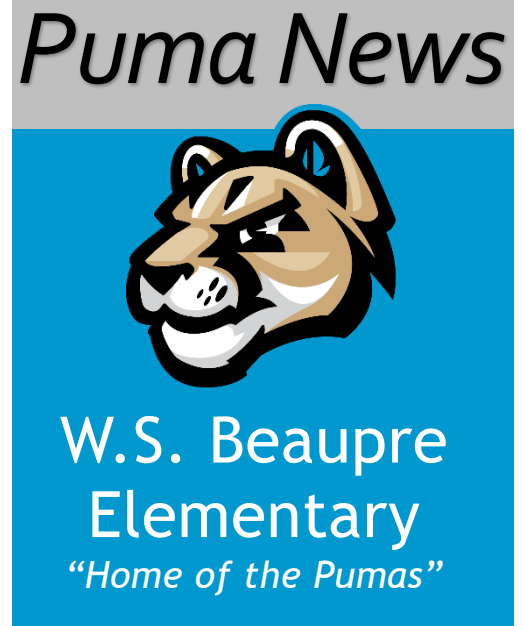
FIRST EDITION, VOLUME 2: 2019